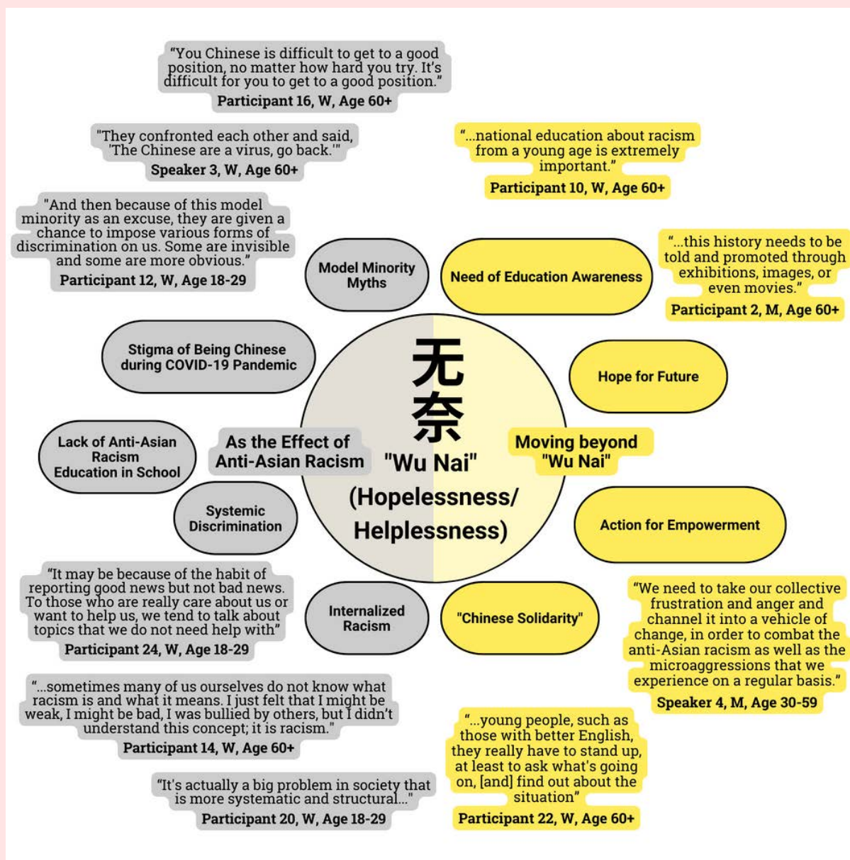
Figure 3: “Wu Nai” as the Effect of Anti-Asian Racism & Moving Beyond “Wu Nai”