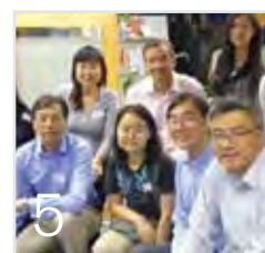
Pursuing Research Across the Globe